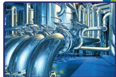
Automation and Instrumentation