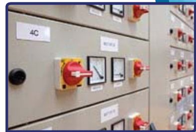
Motor Control Centres