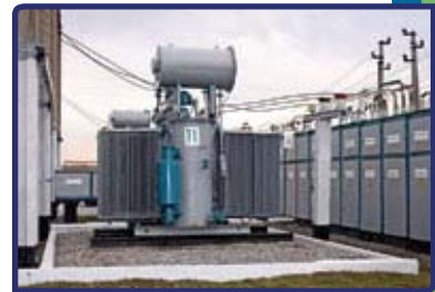
Electrical Engineering (MV & LV)